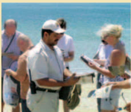
Beach area inWRPA