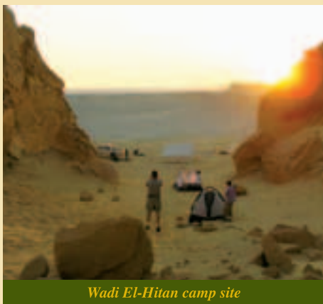
Wadi El-Hitan camp site