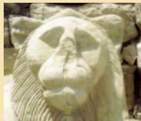
Ancient Medinet Madi