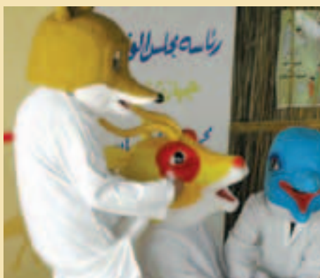
Environmental education for children