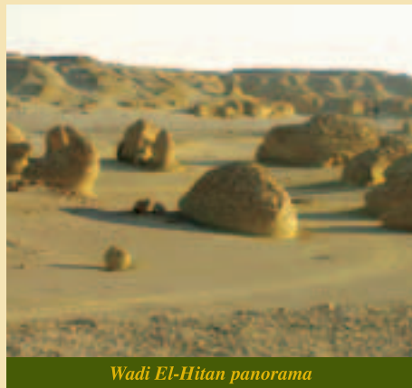
Wadi El-Hitan panorama